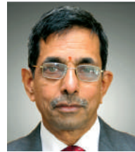
K. Parameswaran International Finance